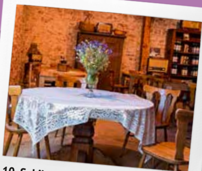
10. Sabile Cider Brewery