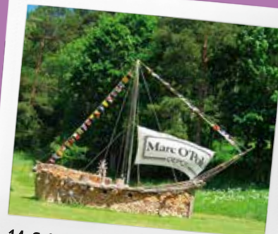
14. Sabile Old-times museum

15. Flying with Paraplan in tandem over Sabile, 29476236