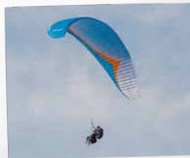
15. Flying with Paraplan in tandem over Sabile

- Holiday house "Bungas", "Bungas", Abavas pagasts, 26594639