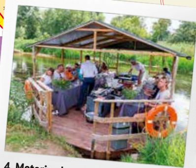
4. Motorized raft on Abava