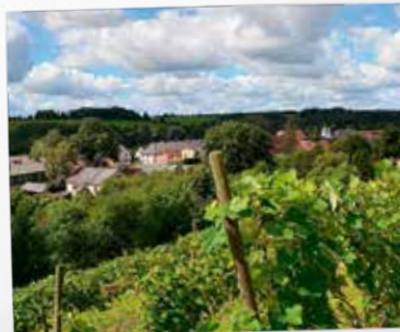
9. Sabile Wine Hill

7. Sabile castle mound, Talsu iela, Sabile, GPS-57.046993, 22.574939