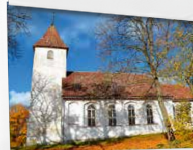
8. Sabile Lutheran church