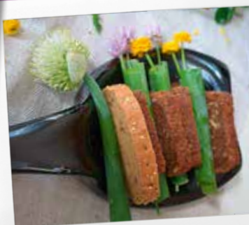
12. Creative house "Sarade"