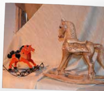
11. Wooden Toy Museum