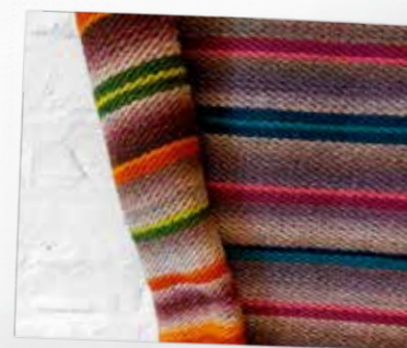
Weavers' Group "Talse" Workshop