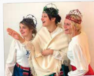
Creative Yard Tour with King's Daughters

For photo sessions contact the wedding photographers of Talsi Photo Club Aleksandrs Tarabanovskis 29417254, Kaspars Poriņš 29293672, Dzintars Krastiņš 27499173