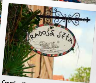
Creative Yard of Talsi Culture Center

The heart of the Talsi old town is the Creative Yard of Talsi Culture Center, built in 2013, by attracting funding from the European Regional Development Fund, renovating and equipping a modern courtyard inhabited by artists, photographers, musicians and craftspeople. Roof terraces and courtyards are great venues for concerts, fairs and other events. Visitors have the opportunity to see the local craft works and also create their own souvenir by appointment, as well as go on a tour of the Creative Yard with one of the King's Daughters.