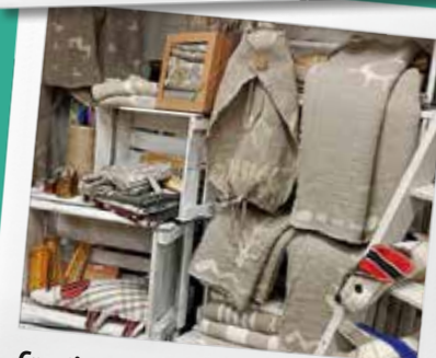
Creative Room "Patrepe"