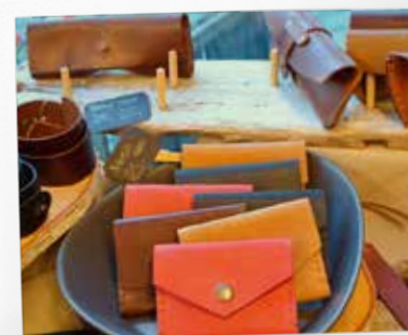
Leather Crafts Workshop "StoneHill"